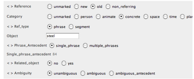
Figure 1: Attributes (partial screenshot)

The corpus was created using the MMAX2 tool (Müller and Strube, 2006), which allows marking text units at different