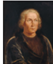
Picture Christopher Columbus

(1451-1506), was an outstanding navigator and organizer of expeditions. He achieved fame by sailing across the Atlantic Ocean from Europe in search of a western sea route to Asia. However, he never accomplished this goal. Instead, in 1492, he encountered islands in the Caribbean Sea. Until that time, Europeans and Native Americans had not been aware of each other's existence. During his four voyages westward, between 1492 and 1504, Columbus explored the Caribbean region and parts of Central and South America.